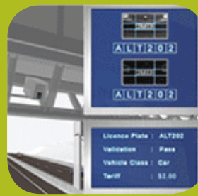
Your toll is calculated

As you pass under the toll point, cameras capture an image of your vehicle's registration plate number