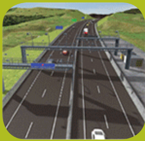
As you approach the toll point

There are no toll booths to stop and pay - you simply drive along the toll road